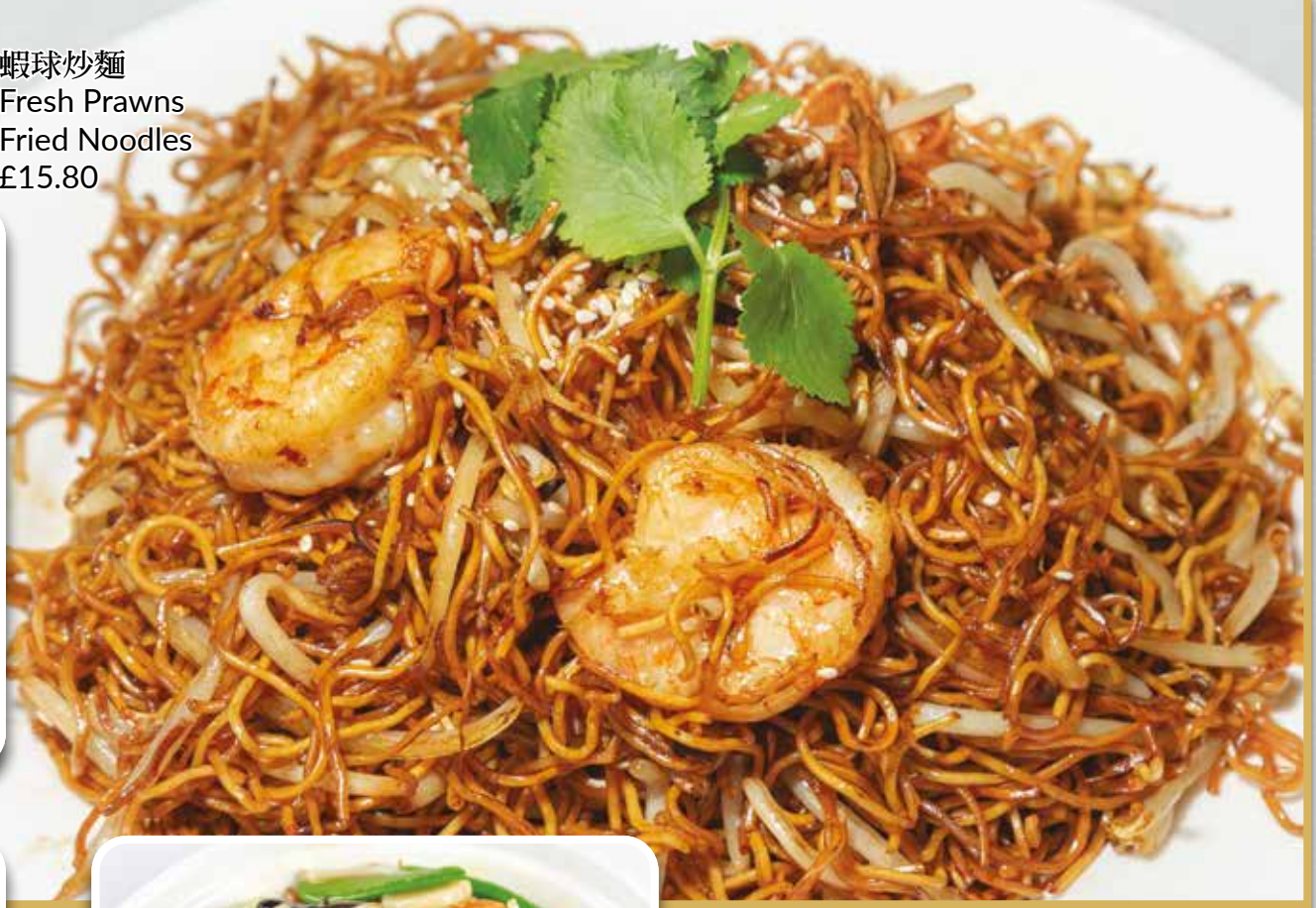
蝦球炒麵 Fresh Prawns Fried Noodles £15.80