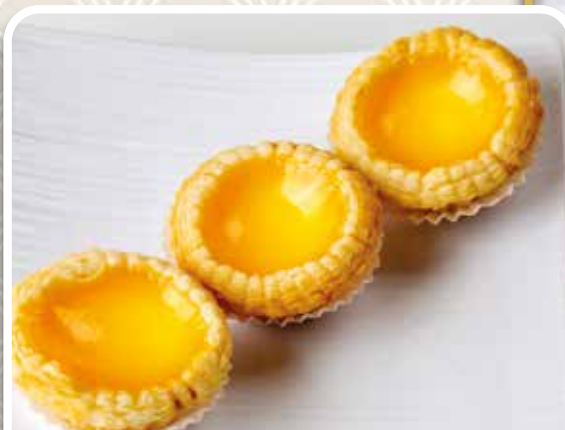
酥皮雞蛋撻 Freshly Baked Egg Tarts £5.80