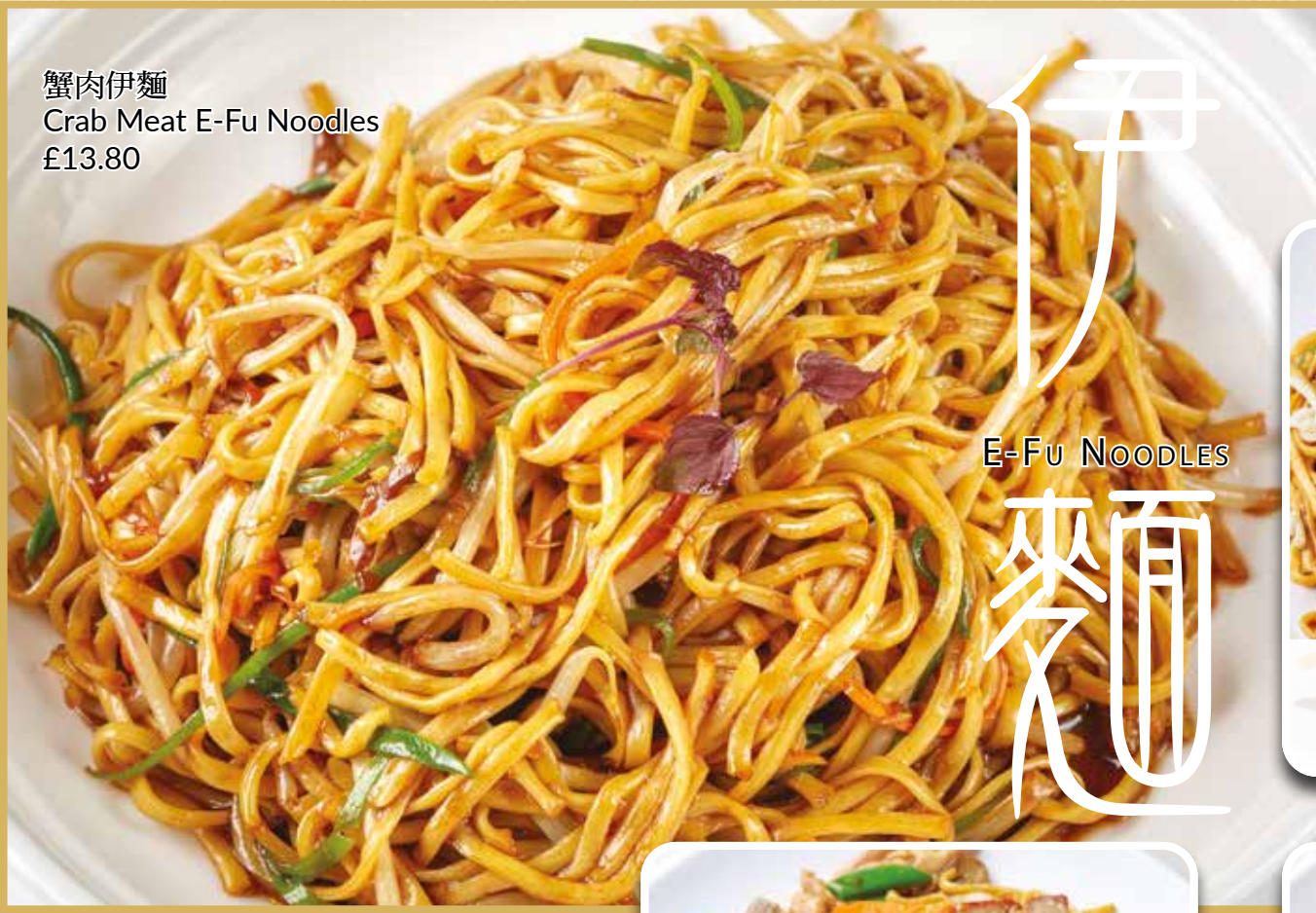
蟹肉伊麵 Crab Meat E-Fu Noodles £13.80