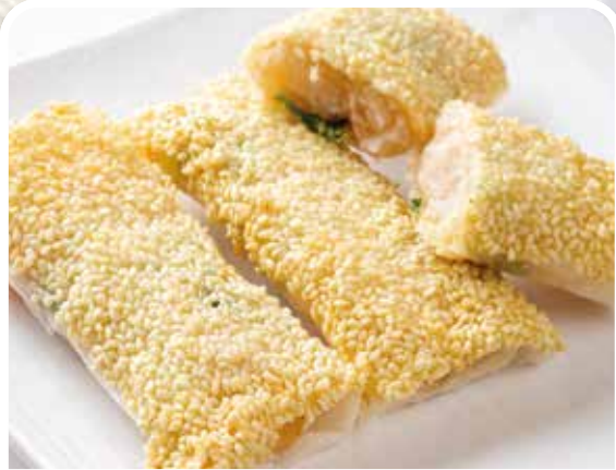
芝麻炸蝦卷 Sesame Prawn Rolls £6.80