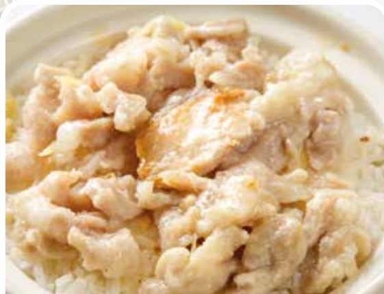
鹹魚肉片飯 Salted Fish & Pork Rice Pot £8.80