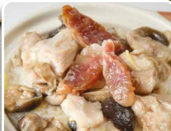
臘腸盅雞飯 Chinese Cured Sausage & Chicken Rice Pot £8.50