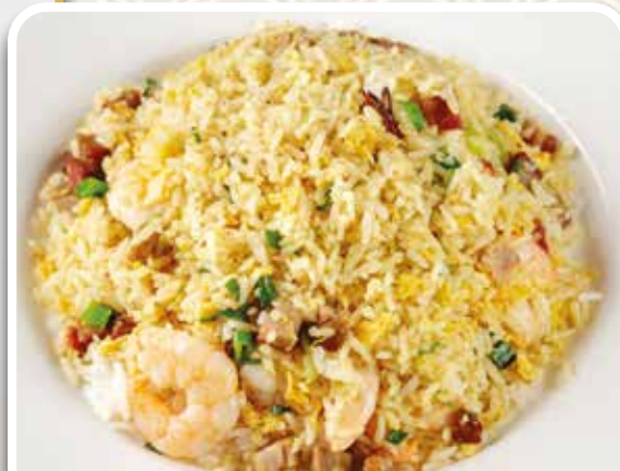
揚州炒飯 Yeung Chow Fried Rice £15.80