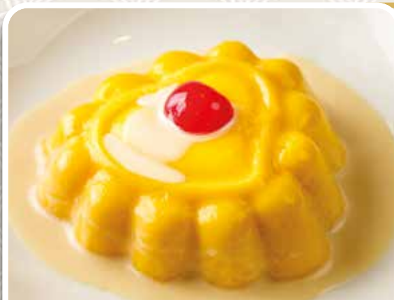
芒果布甸 Chilled Mango Pudding £5.80