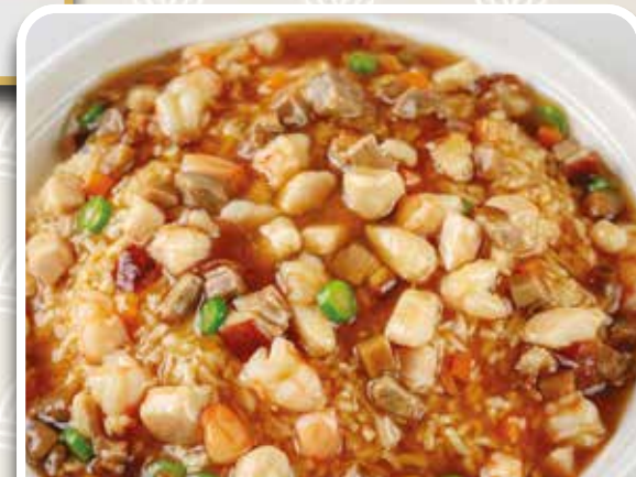
福建炒飯 Fukien Fried Rice £15.80