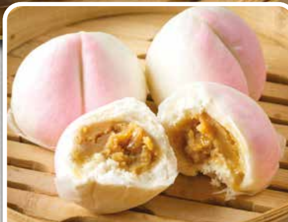
蛋黃蓮蓉壽包 Sweet Lotus Seed Buns £6.50