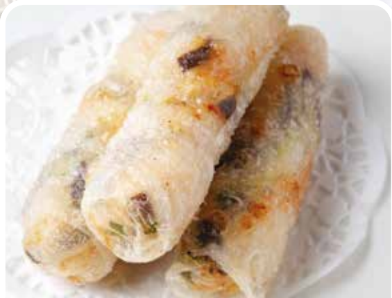
越南春卷 Vietnamese Spring Rolls £6.50