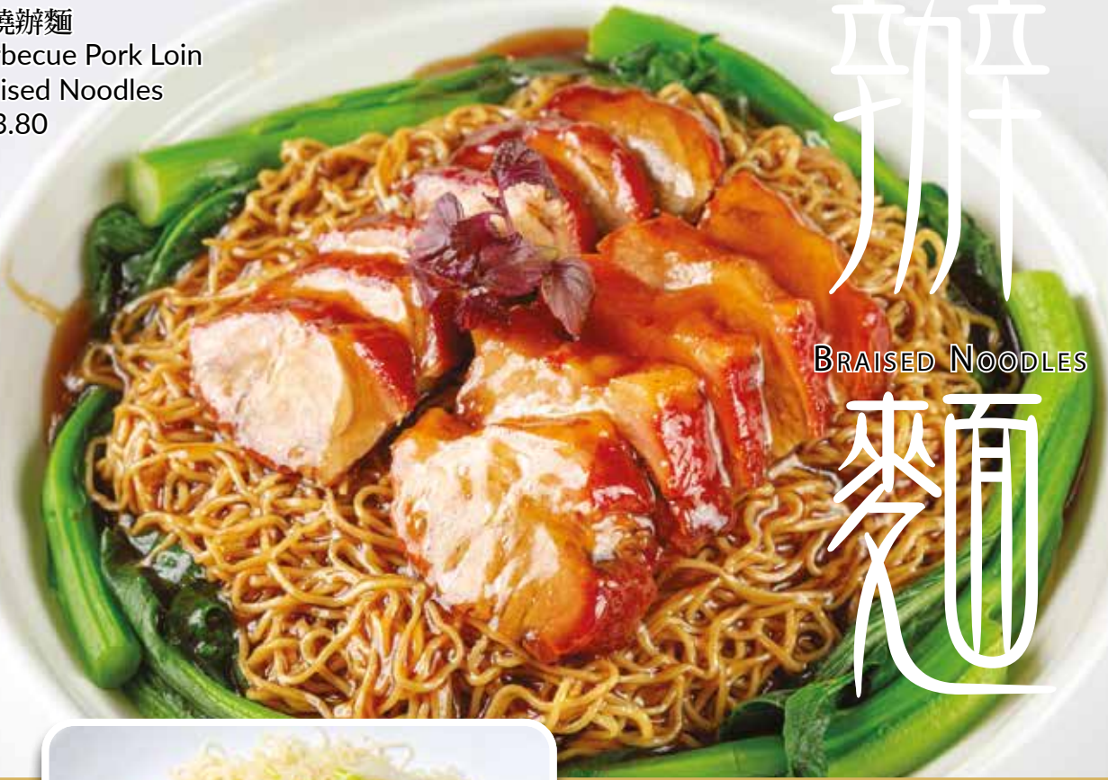
叉燒辦麵 Barbecue Pork Loin Braised Noodles £13.80