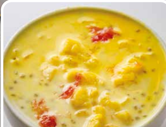
楊枝甘露 Chilled Mango & Pomelo Sago £6.50