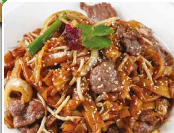
乾炒牛河 Sliced Beef Ho Fun with Soya Sauce £13.80