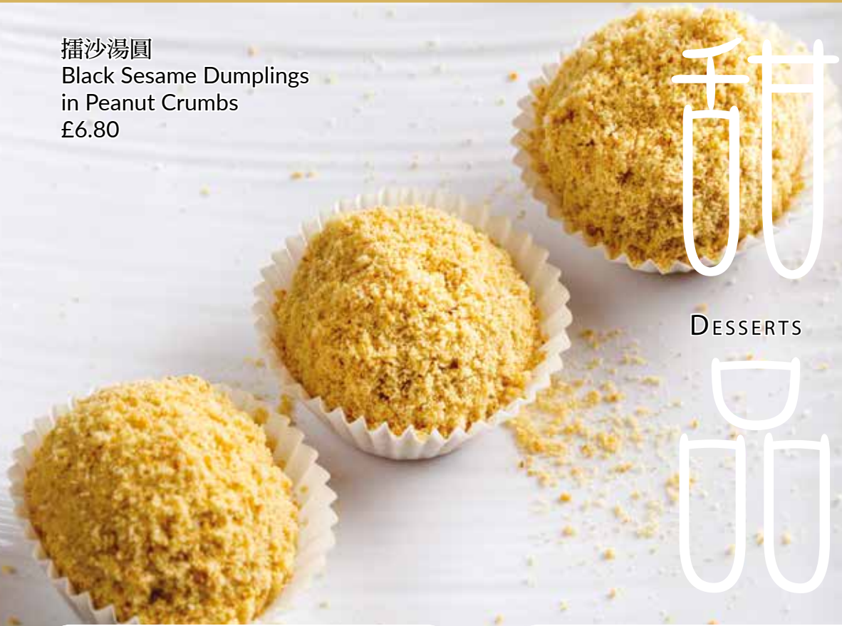
播沙湯圓 Black Sesame Dumplings in Peanut Crumbs £6.80