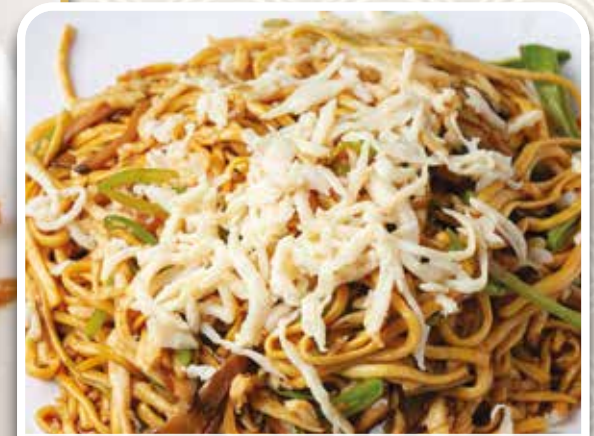
雞絲伊麵 Shredded Chicken E-Fu Noodles £13.80