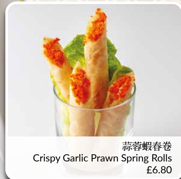
蒜蓉蝦春卷 Crispy Garlic Prawn Spring Rolls £6.80