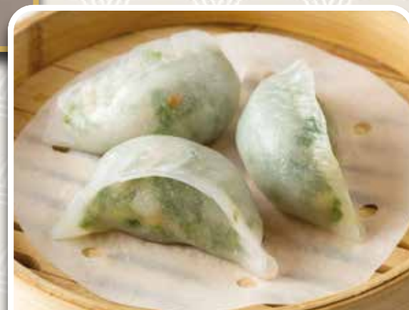
鮮蝦韭菜餃 Prawn & Chive Dumplings £6.80