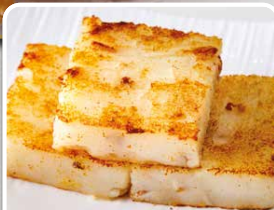
臘味蘿蔔糕 Turnip Cake with Cured Meats £6.80