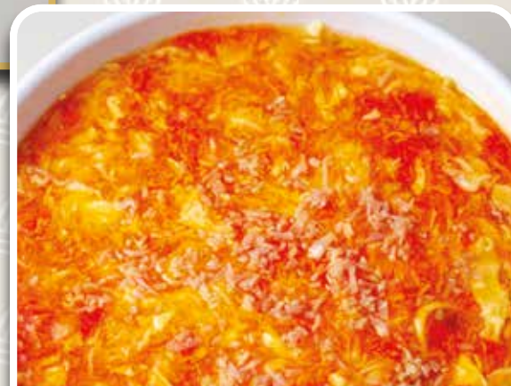
鴻圖窩麵 Crab Meat & Roe Soup Noodles £15.80