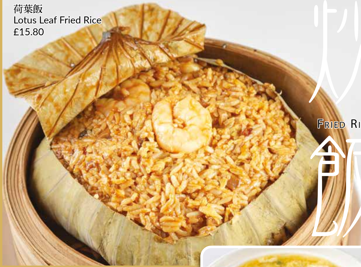
荷葉飯 Lotus Leaf Fried Rice £15.80