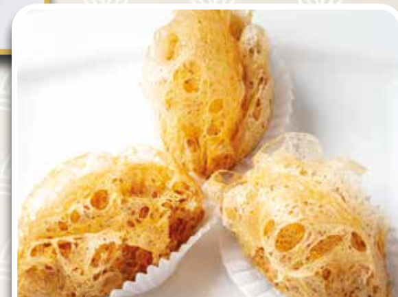
★ 荔茸芋角 Fried Yam Paste Meat Dumplings £5.80