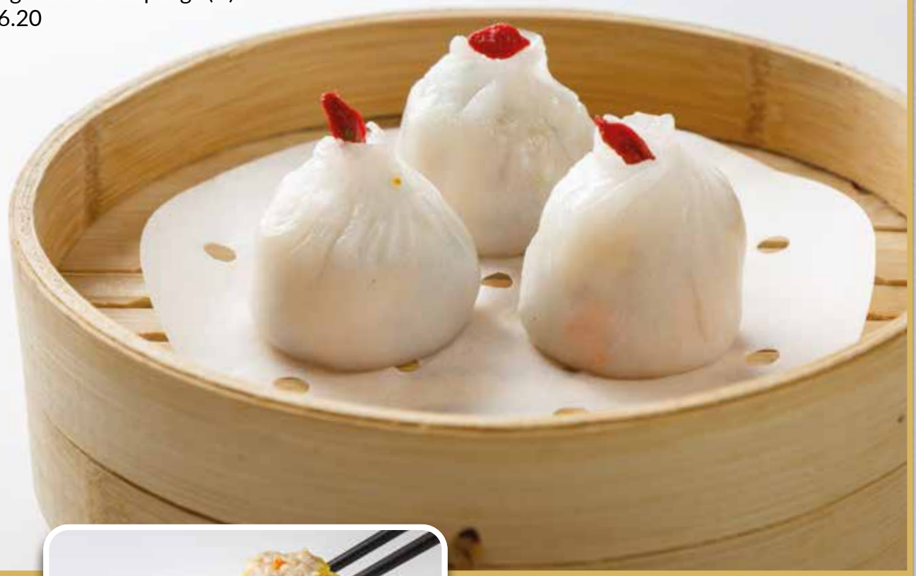
水晶羅漢餃 Vegetarian Dumplings (V) £6.20