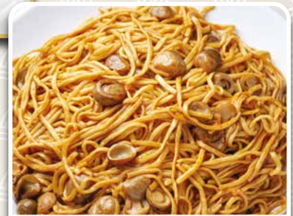
乾燒伊麵 Straw Mushrooms E-Fu Noodles £13.80