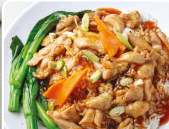
菜遠雞球飯 Chicken & Vegetables with Rice £13.80