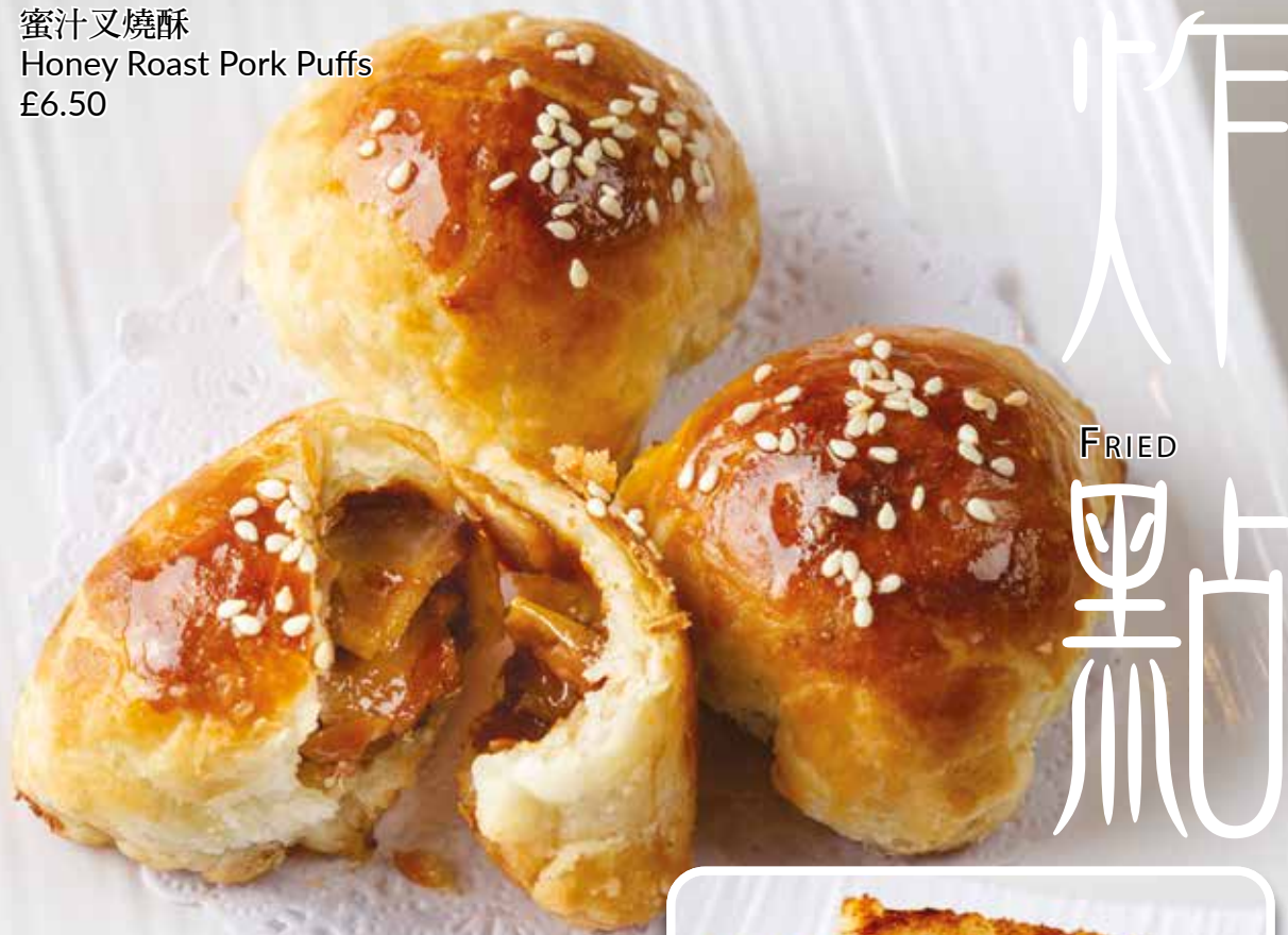
蜜汁叉燒酥 Honey Roast Pork Puffs £6.50