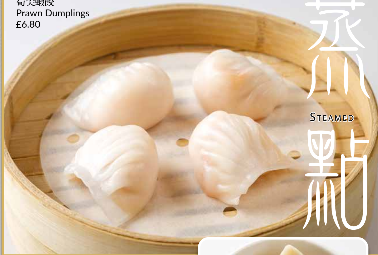
筍尖蝦餃 Prawn Dumplings £6.80