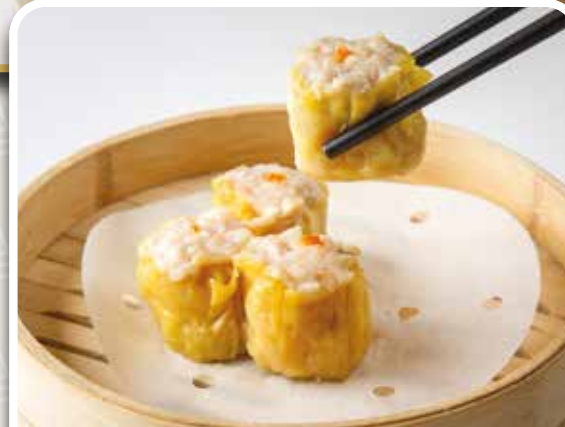
乾蒸燒賣 Minced Pork & Shrimp Dumplings £6.50

豉汁排骨 Spare Ribs in Black Bean Sauce £6.50