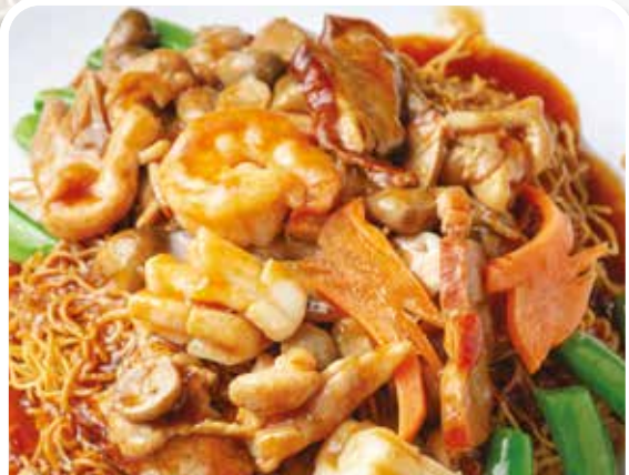
雜燴炒麵 Assorted Meats Fried Noodles £14.80