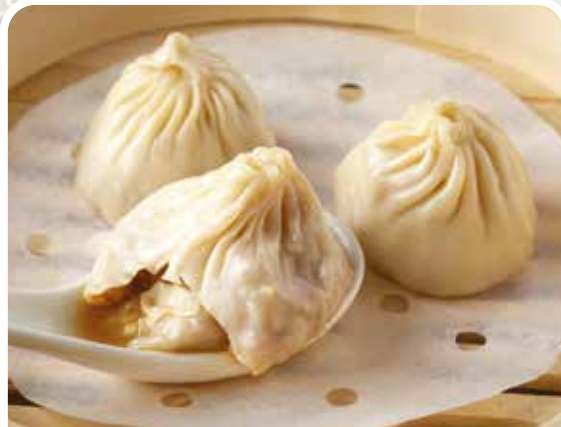
上海小籠包 Shanghai Pork Dumplings £6.80