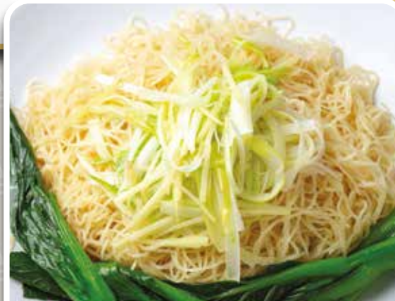
薑蔥辦麵 Ginger & Spring Onions Braised Noodles £10.00