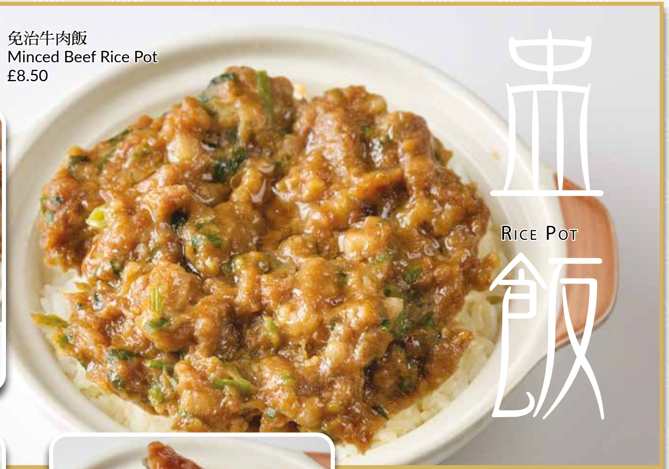
免治牛肉飯 Minced Beef Rice Pot £8.50