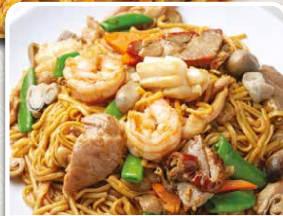
燴府伊麵 Mixed Meat E-Fu Noodles £14.80