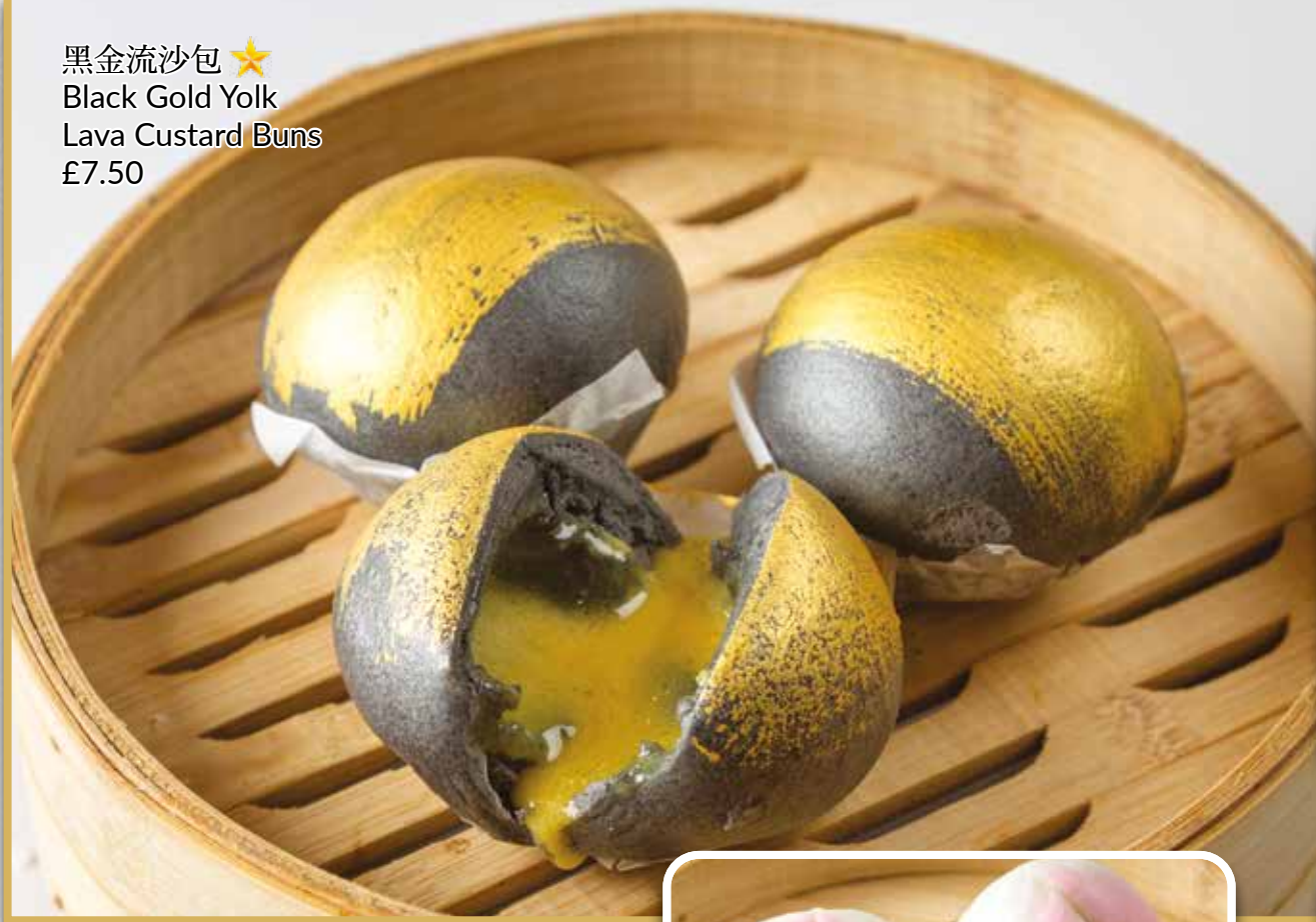
黑金流沙包 ★ Black Gold Yolk Lava Custard Buns £7.50