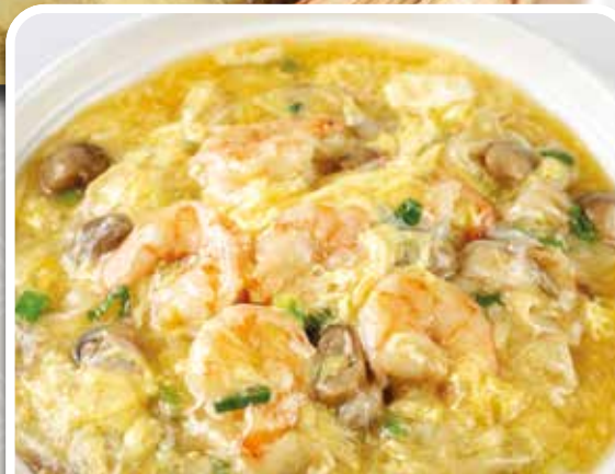
滑蛋蝦飯 Fresh Prawns & Scrambled Egg Rice £15.80