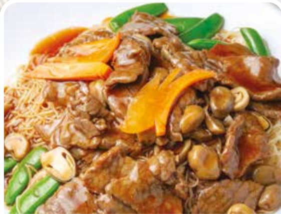
牛肉辦麵 Sliced Beef Braised Noodles £13.80