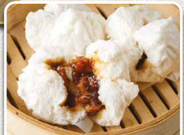
蠔油叉燒包 Roast Pork Buns £6.80