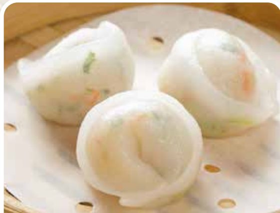
翡翠帶子餃 Scallops Dumplings £6.80