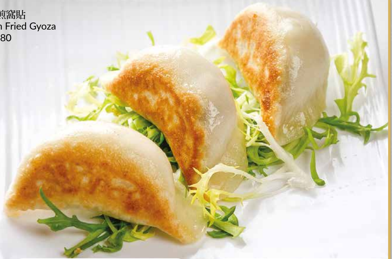
生煎窩貼 Pan Fried Gyoza £6.80