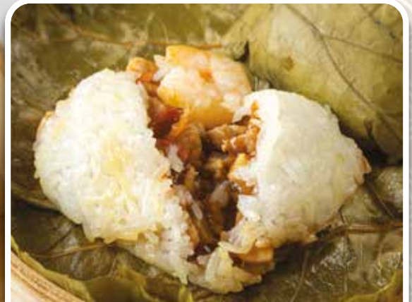
金牌糯米雞 Glutinous Rice in Lotus Leaves £7.50