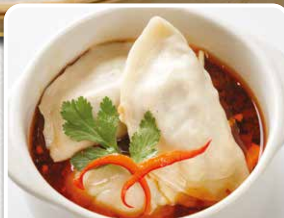
紅油餃子 Pork Dumplings in Chilli Sauce £6.80