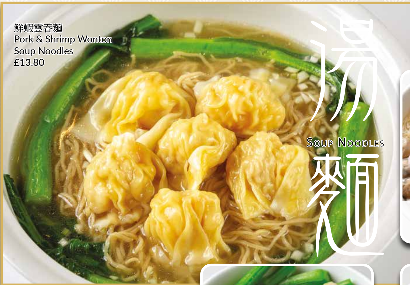
鮮蝦雲吞麵 Pork & Shrimp Wonton Soup Noodles £13.80