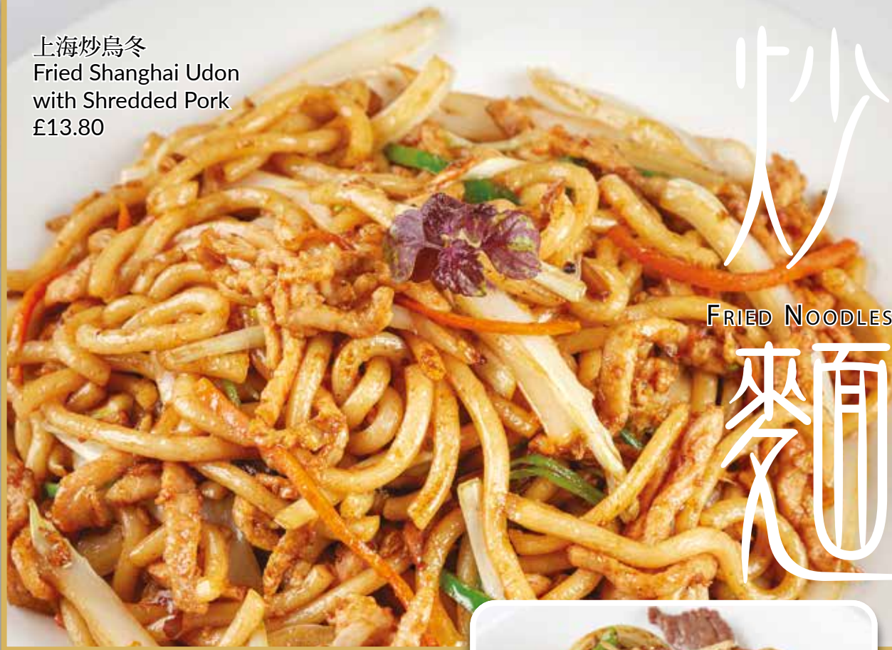
上海炒烏冬 Fried Shanghai Udon with Shredded Pork £13.80