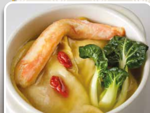
上湯蟹肉灌湯餃 Crab Meat Dumpling Soup £7.80