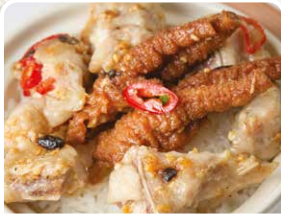
鳳爪排骨飯 Spicy Chicken Feet & Spare Ribs Rice Pot £8.50