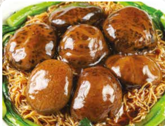
北菇辦麵 Black Mushroom Braised Noodles £12.80