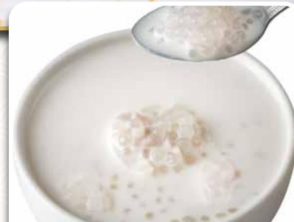
芋頭西米露 Chilled Taro & Coconut Sago £5.80