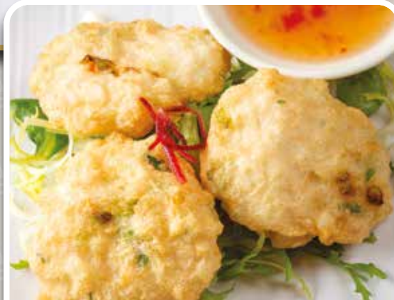
煎炸墨魚餅 Fried Minced Cuttlefish Balls £6.80