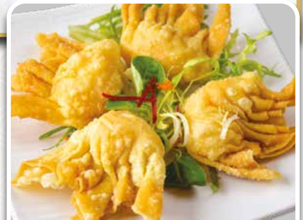
沙律明蝦角 Deep Fried Prawn Dumplings £6.80