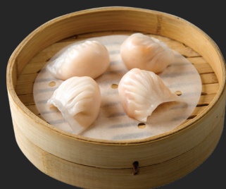
Prawn Dumplings 筍尖蝦餃