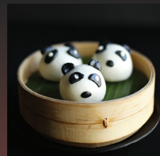
Sweet Panda Bun 可愛熊貓包

Seafood Dim Sum Platter (8 pcs) 海鮮點心雜錦拼盤 (8隻) £20.80