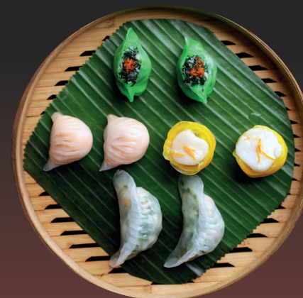
Seafood Dim Sum Platter 海鮮點心雜錦拼盤

Vegetarian Dumplings Platter (8 pcs) 齋餃拼盤 (8隻) £19.80